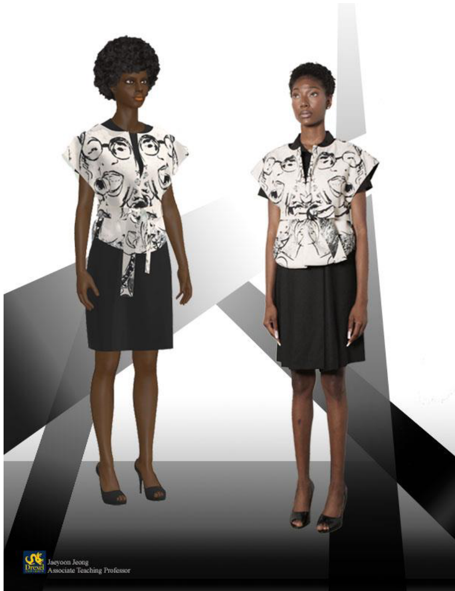
Collaboration with Liz Goldberg: A little cape coat, using CLO 3D patternmaking, a digitally printed fabric design