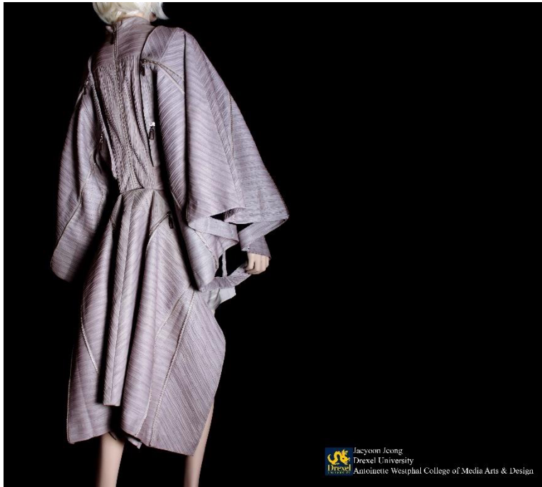
Sustainable Fashion Design: Upcycling Initiative