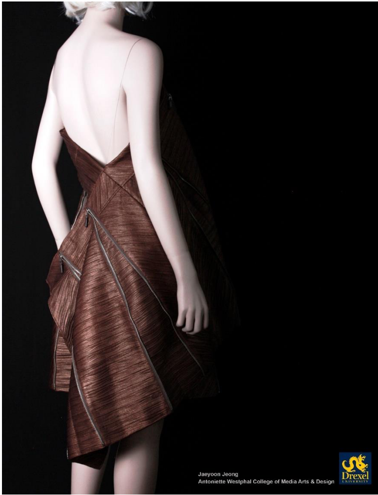
Sustainable Fashion Design: Upcycling Initiative