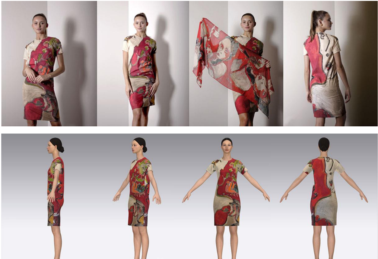
Collaboration with Liz Goldberg: A raglan sleeve dress, created using CLO 3D patternmaking, a digitally printed fabric design