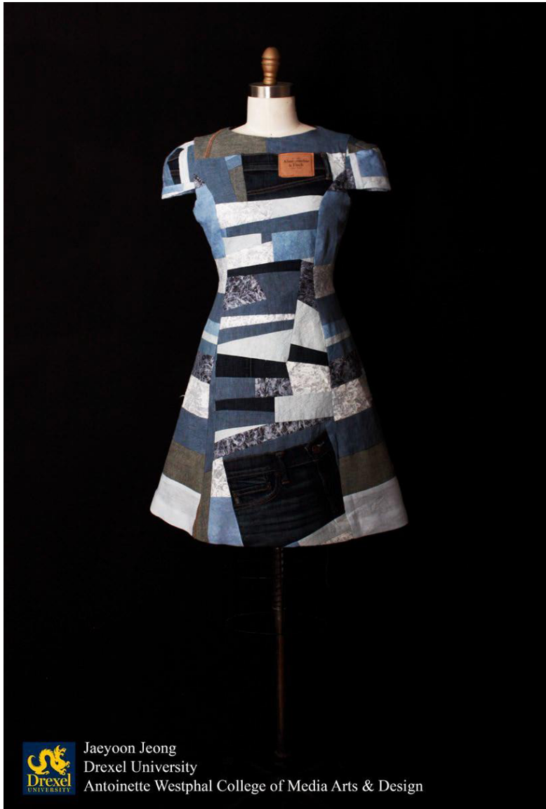
Sustainable Fashion Design: Recycling Initiative, a “ Jogakbo ” patchwork dress