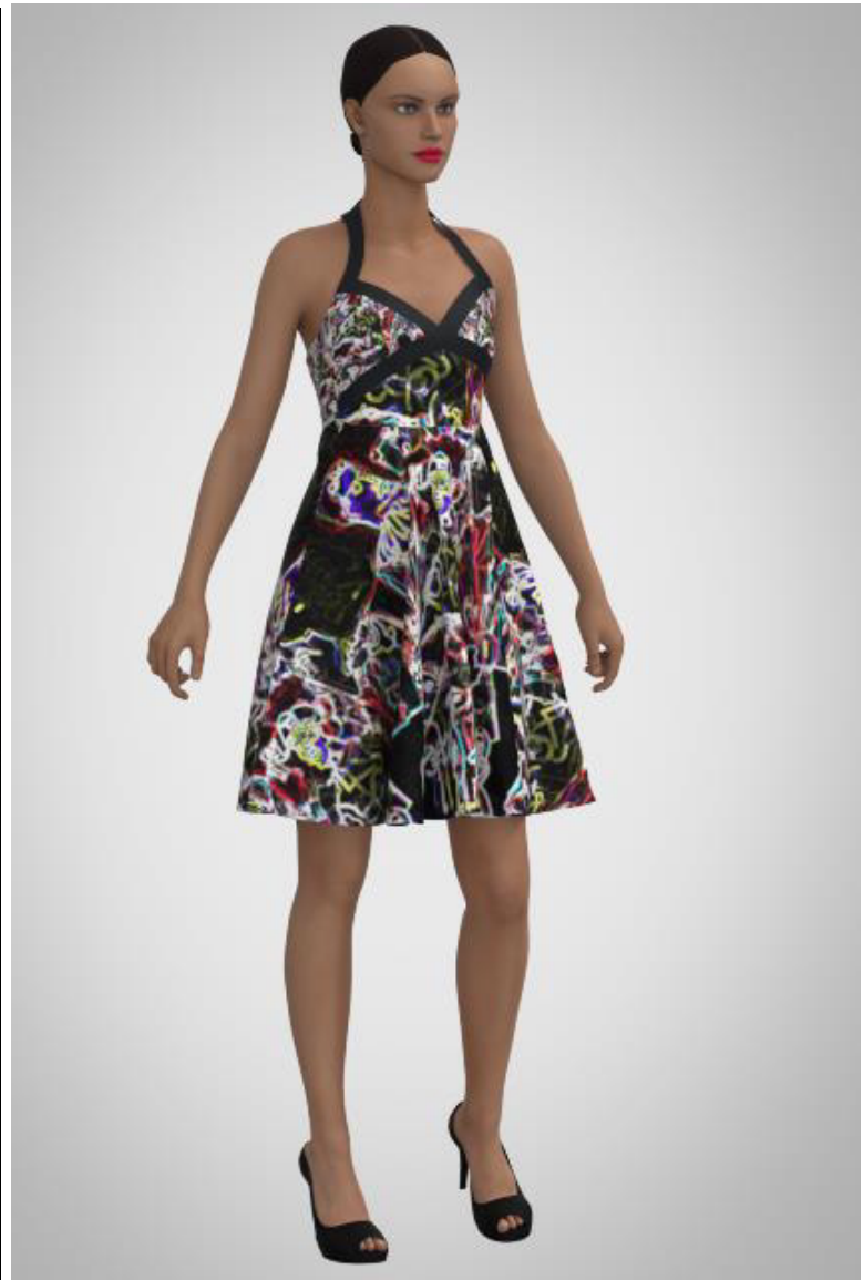
Collaboration with Liz Goldberg: A summer dress, created using CLO 3D patternmaking, a digitally printed fabric design