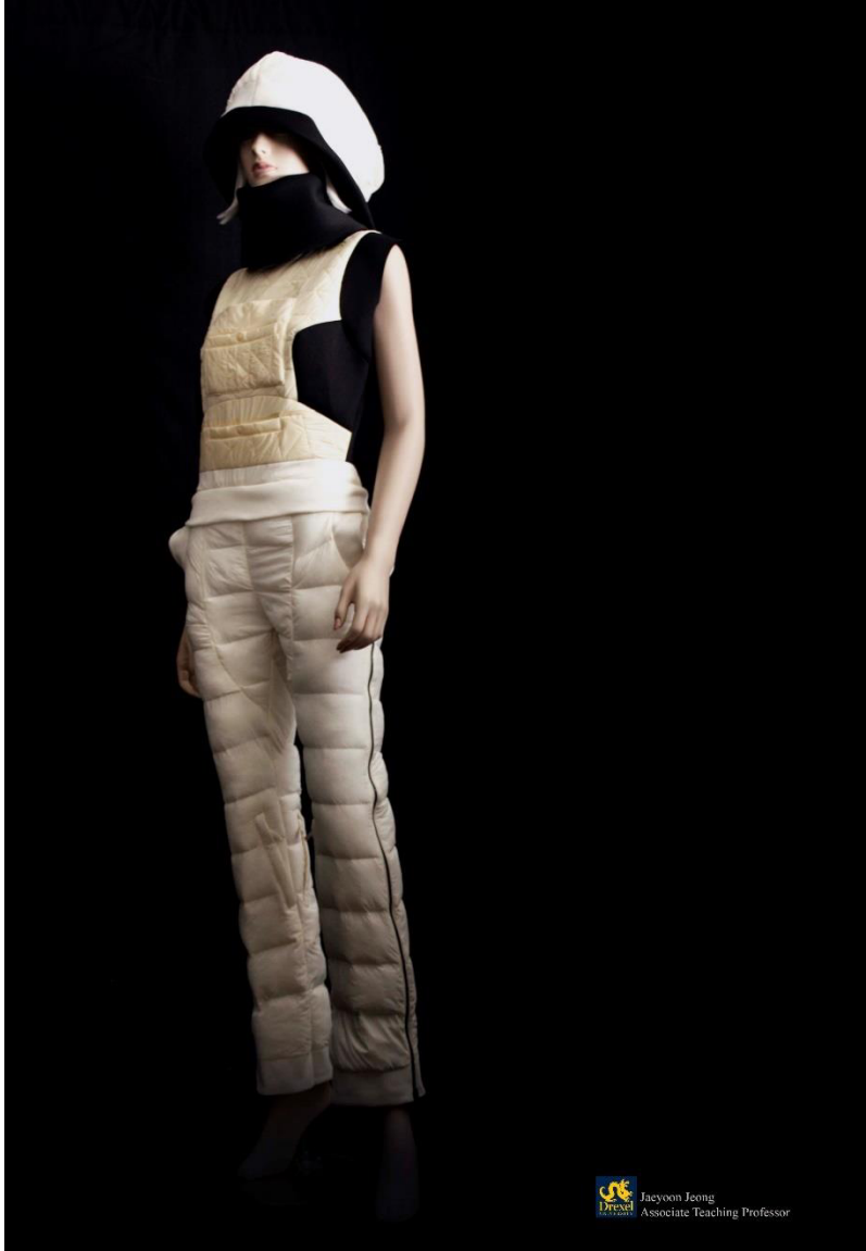
Sustainable Fashion Design: Upcycling Initiative (Sponsored by North Face Korea)