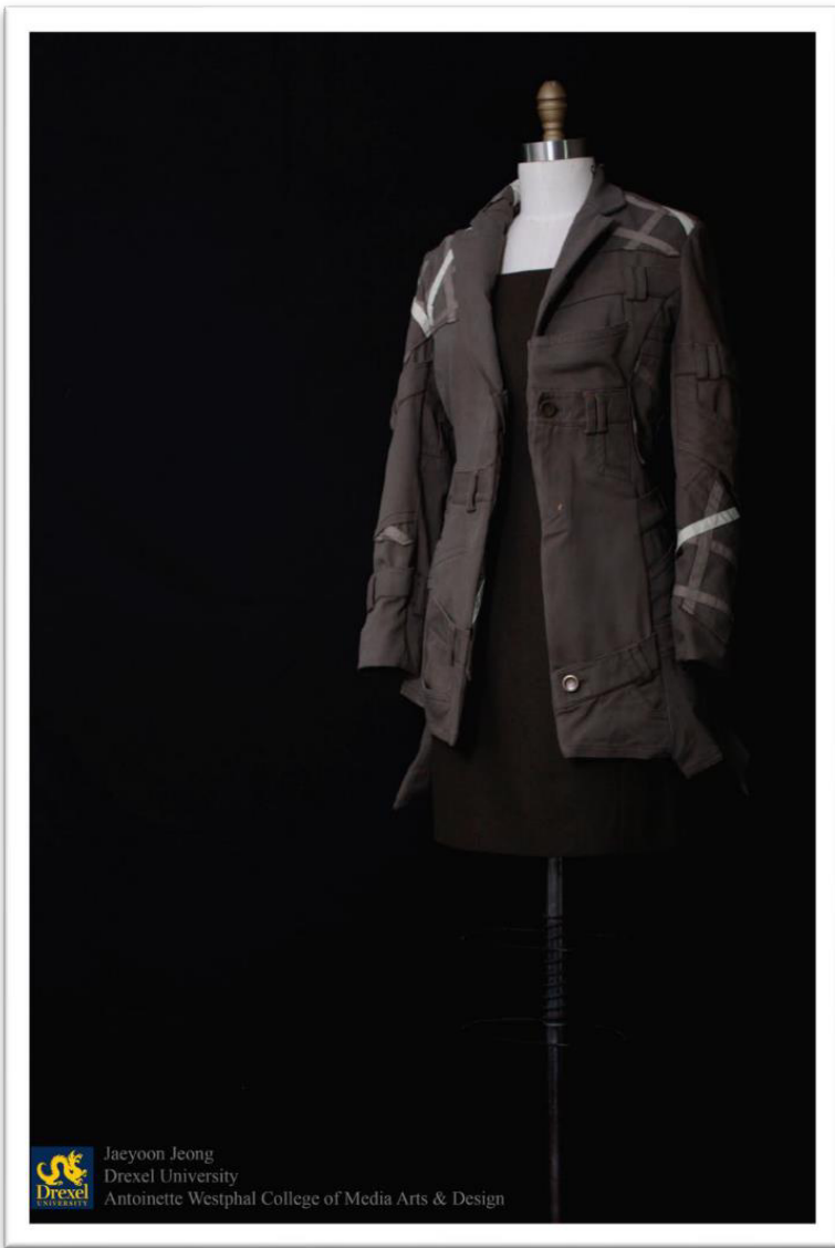
Sustainable Fashion Design: Upcycling Initiative