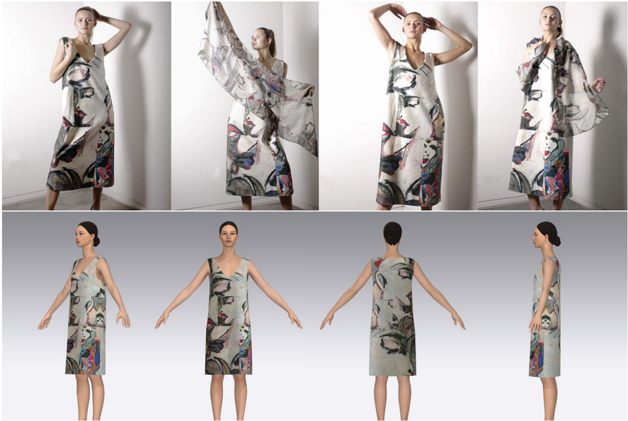
Collaboration with Liz Goldberg: A oversize V-neck dress, created using CLO 3D patternmaking, a digitally printed fabric design