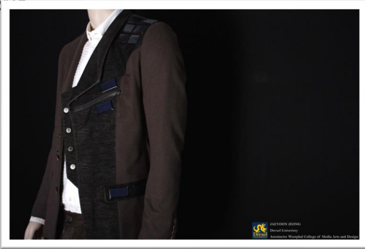
Sustainable Fashion Design: Upcycling Initiative