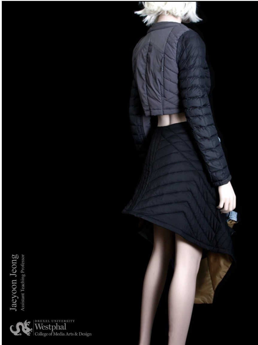
Sustainable Fashion Design: Upcycling Initiative (Sponsored by North Face Korea)