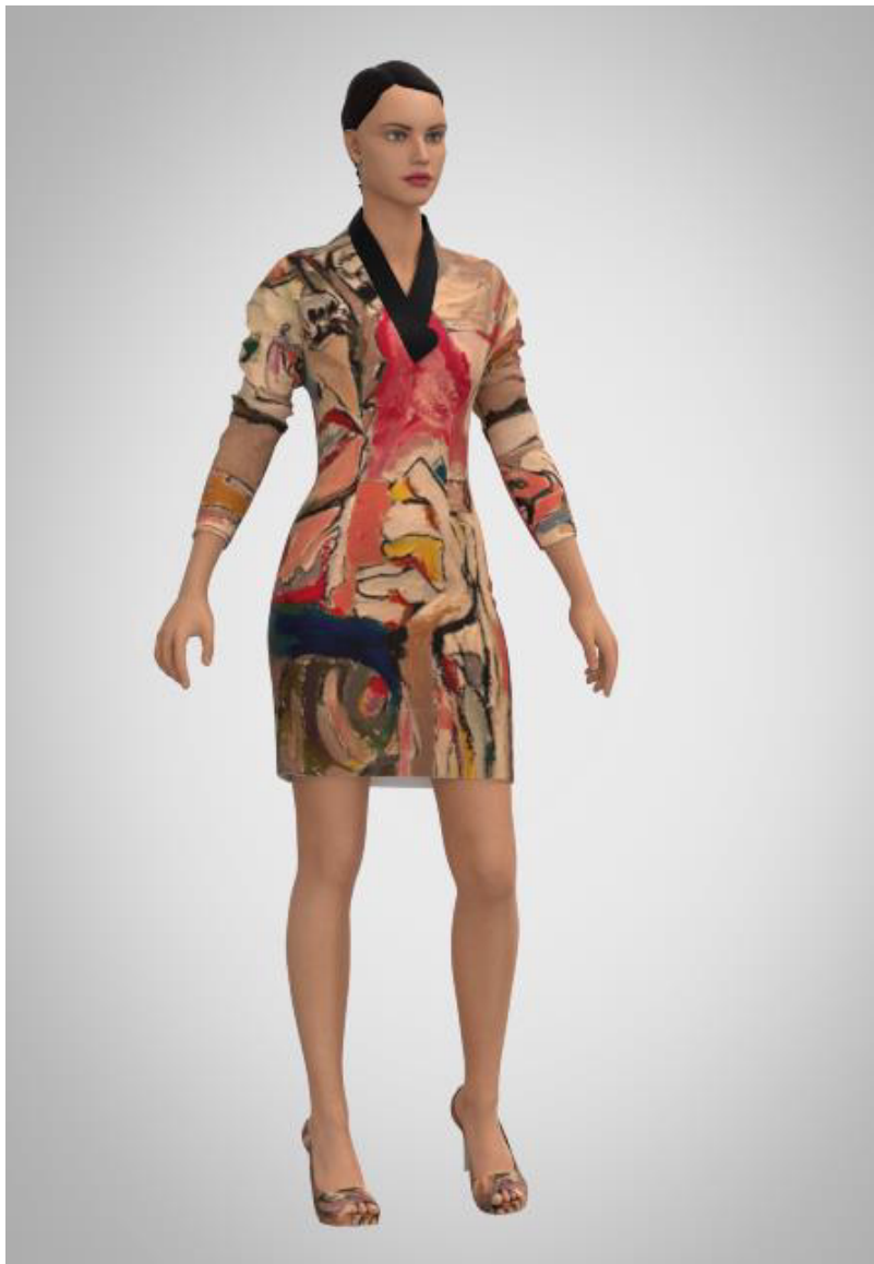
Collaboration with Liz Goldberg: A fitted dress, created using CLO 3D, a digitally printed fabric design