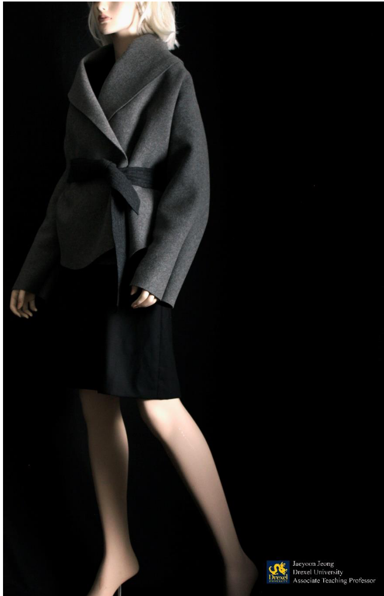
Gender-neutral coat, featuring an oversized shawl collar