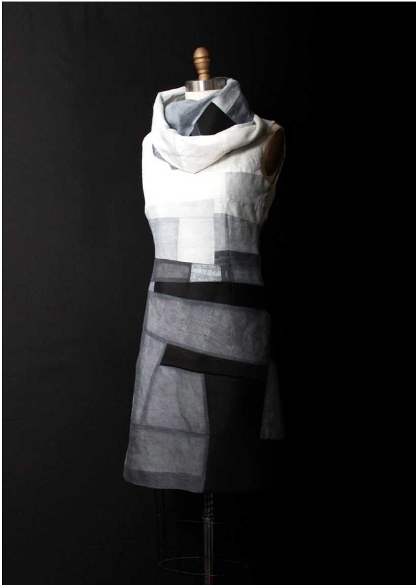
Patchwork dress crafted with hand-dyed 'Jogakbo' technique