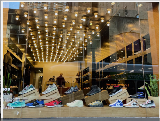
Appealing front window view