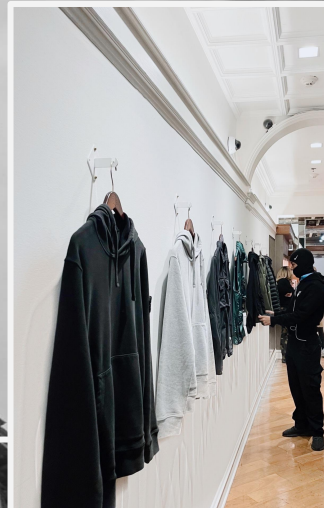
All decorations are Atmos products