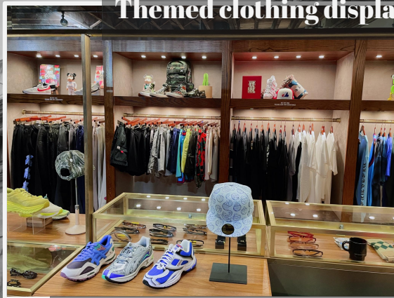
High fashion presentation