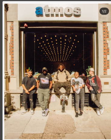
Atmos Philadelphia Staff: Featured on Atmos' Instagram