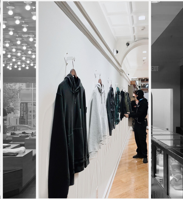
Clean & Pristine