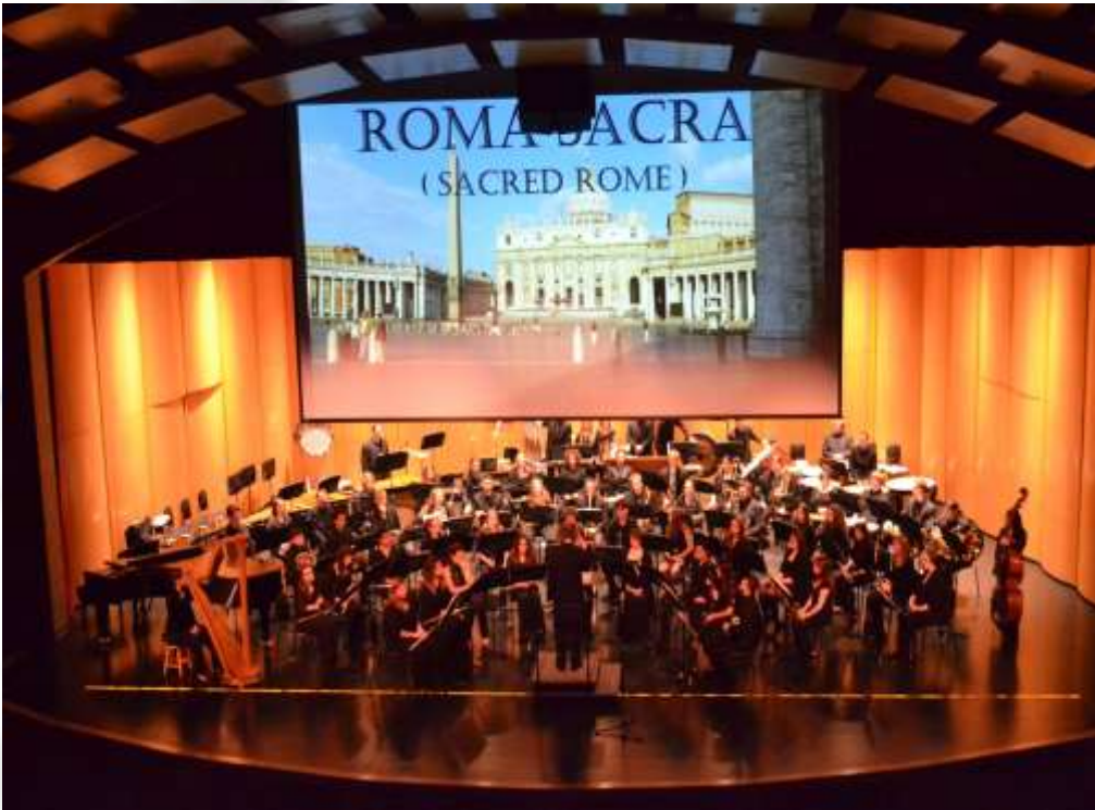
IWE International Wind Ensemble - IMP