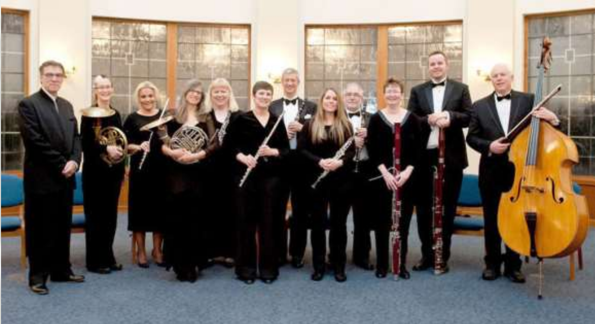
WVO Wisconsin Wind Orchestra - Guest Professional Ensemble of Symposium