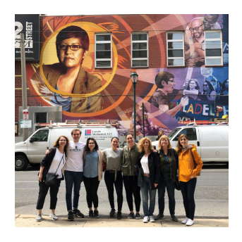
Proud Partner: Beyond the Bell Tours

VisionForward has formed alliances with national and regional nonprofit and professional organizations whose missions and values align closely with ours. Through the support and collaboration of our trusted Allied Organizations (Allies), VisionForward is able to better achieve collective impact as we advance our work toward gender equity.