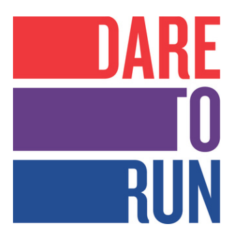
Allied Organization: Dare to Run

Advocates are united by VisionForward's two pillars of action: valuing caregiving and civic participation. They act to accelerate the pace of gender equity in their own local communities and regions by collaborating with other Advocates and Allied Organizations, hosting regional events and speaking engagements, participating in media opportunities and on social media, and collaborating with other leaders in their communities, as well as a variety of other projects.