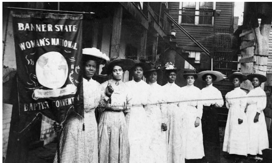
Nannie Burroughs (left) and eight fellow African American women pose with a banner reading: Banner State Woman's National Baptist Convention.