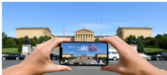
Association for Public Art, a Women 100 Proud Partner, is the Liberty Bell host in Philadelphia, where the image floats above the historic steps of the Philadelphia Museum of Art.