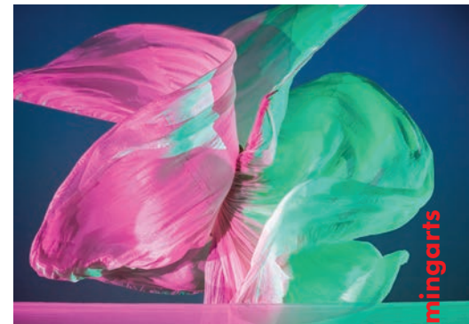
Ice Cycle .