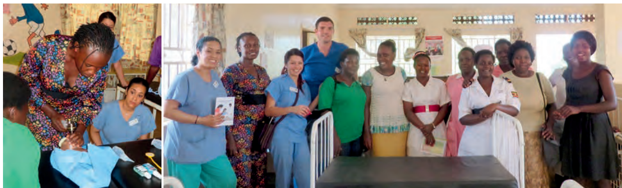
A Drexel team worked with local maternal and infant care providers during a multi-week mission trip in Uganda.

The latest trip was just one part of the ongoing relationship between Drexel and Makerere, which will eventually provide distance education between the two institutions. Last year Drexel hosted a group from Makerere, who visited the College of Medicine campus and simulation facilities. Another team visit to our area is planned for 2015.