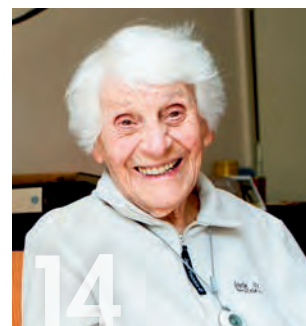
WMC '42 alum is the world's oldest recipient of a doctorate