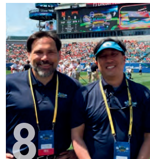
Drexel Sports Medicine provides care to athletes at national events