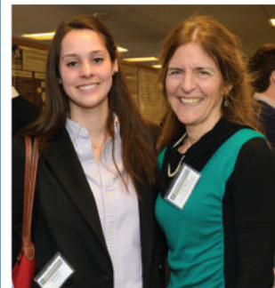
11 MD/PhD student takes first for project in biochemistry