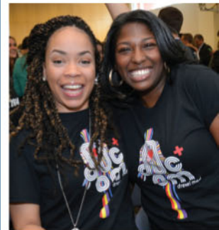
5 Medical students meet their match — in a good way