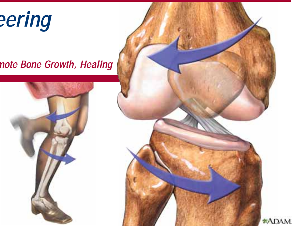
ACL injuries occur when bones of the leg twist in opposite directions under full body weight.