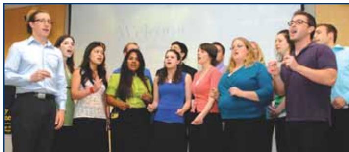
The a cappella singing group "Doctor's Note" performed.