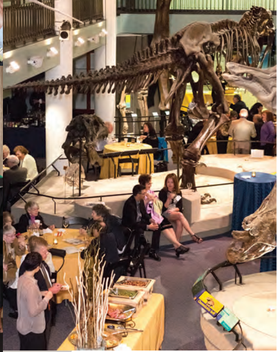
Welcome Reception in Dinosaur Hall at the Academy of Natural Sciences of Drexel University

The 50-year reunion classes are invited to Commencement, and many join the academic procession and are seated with the stage party. Top: During the ceremony, the alumni are called upon to stand and be recognized (faculty are in foreground). Bottom: WMC '65 gets ready to go.