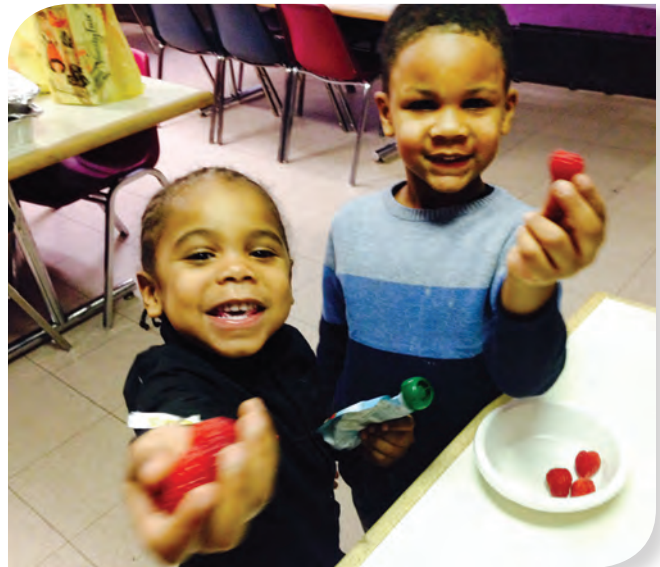
Mothers and children staying at the Eliza Shirley House receive fresh fruit once a week for their evening snack, thanks both to students who carried out their idea for "Nutritious Nibbles" and to a very generous produce vendor.