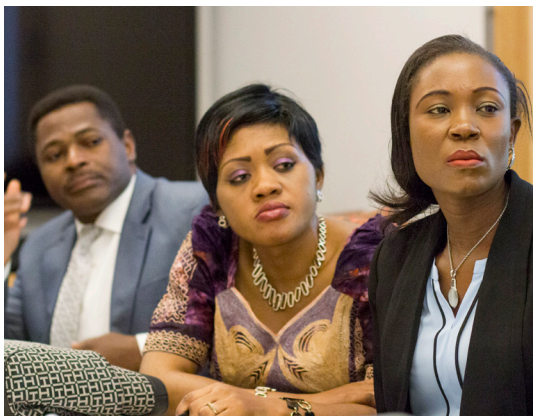
Students from the National School of Administration and Magistracy in Yaoundé, Cameroon visited Kline to learn about legal education in the U.S.