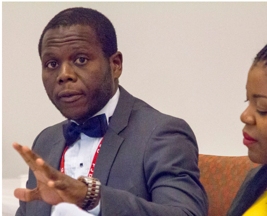
Law School events draw professionals from diverse backgrounds in law, business, science and policy