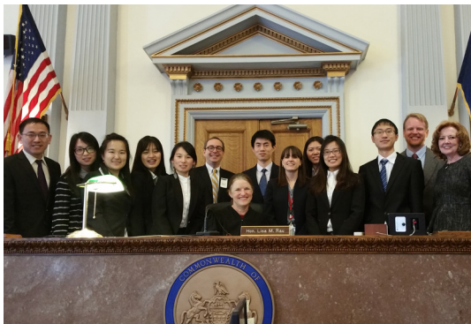
Kline administrators gave visitors from Nankai University in Tianjin, China a tour of Philadelphia that included the Court of Common Pleas