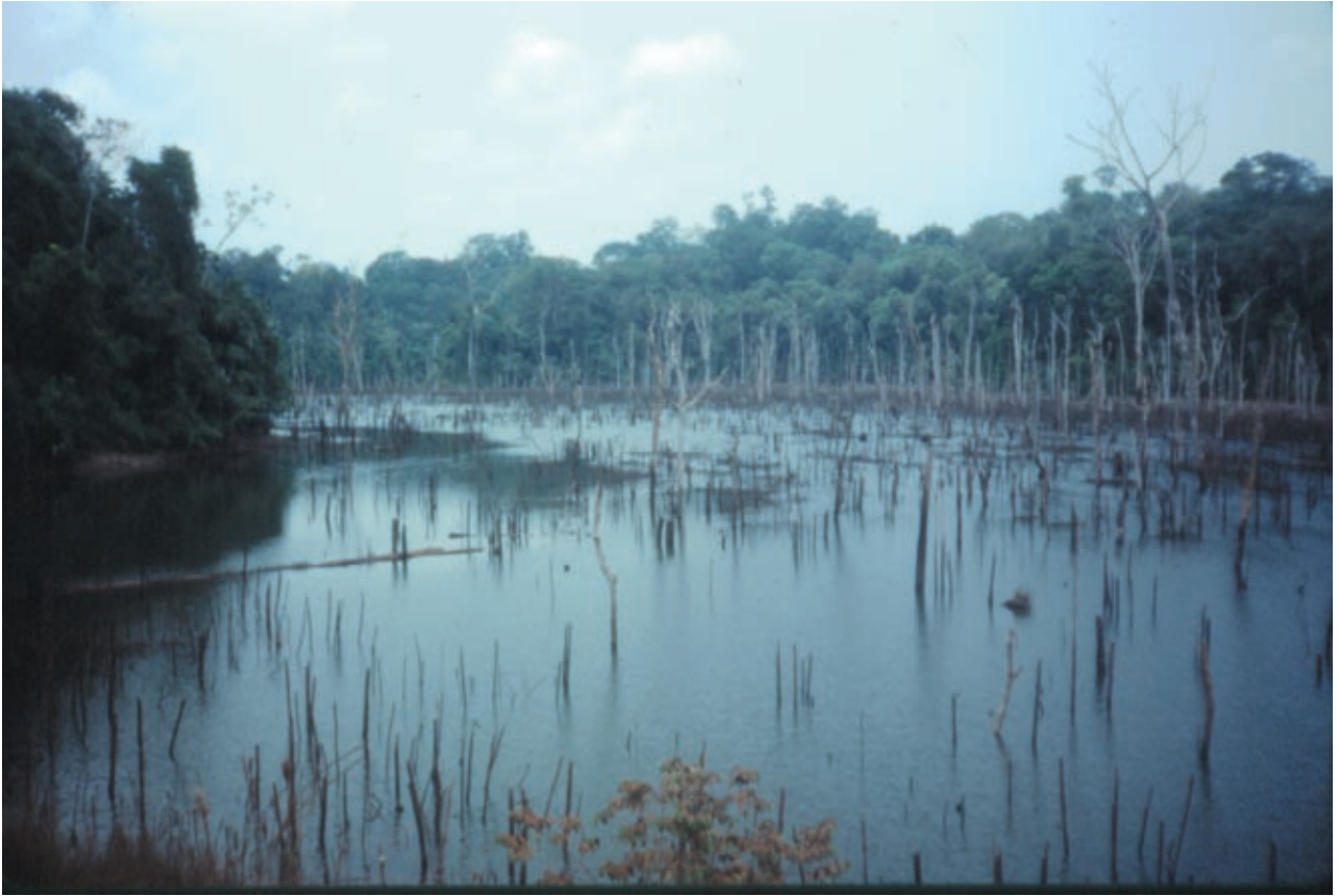
Figure 3. The Caraipé branch of the reservoir, which has a turnover time of seven years, leading to very poor water quality as vegetation decays.

cost of Tucuruí-II is expected to be US$1.25 billion (Indriunas 1998).