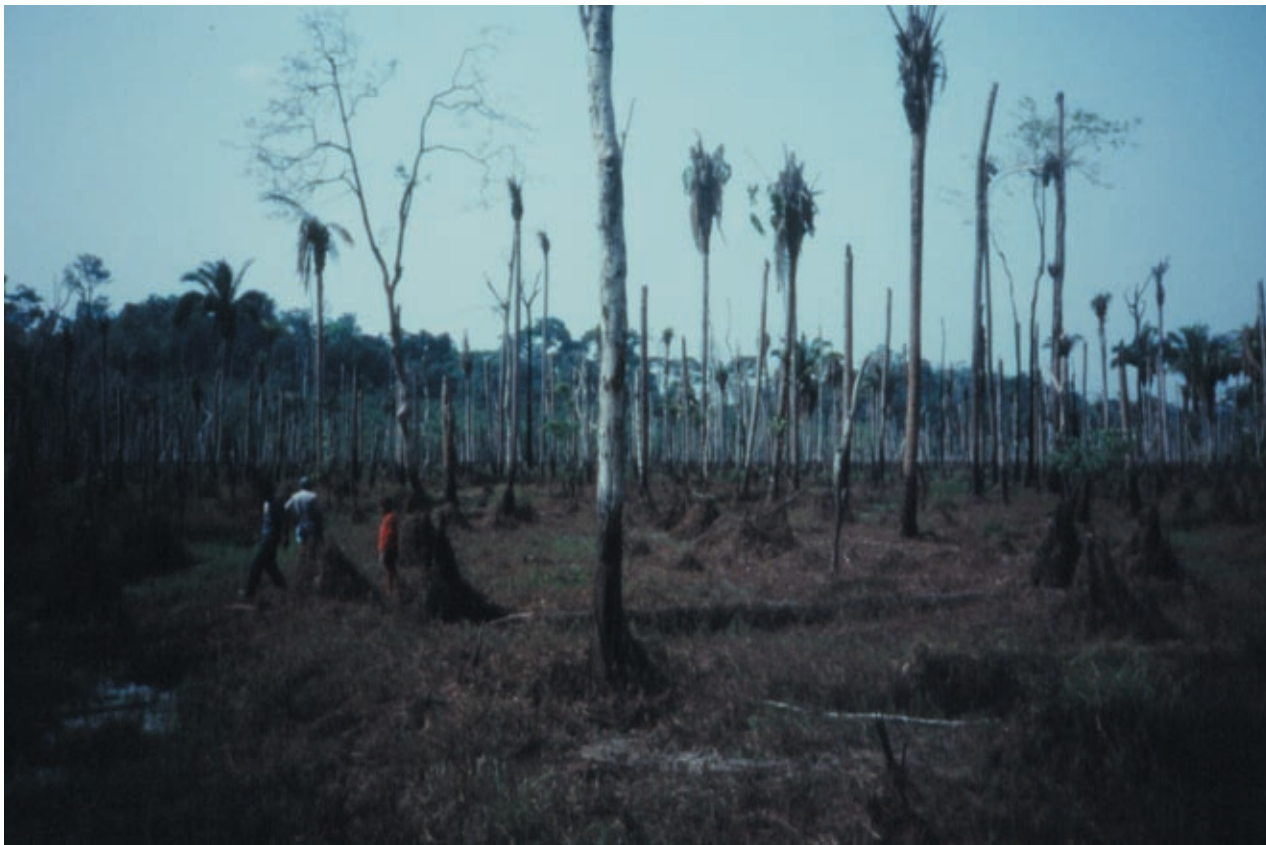
Figure 4. Annual drawdown exposes large areas. Seasonal flooding provides ideal conditions for generation of methane, as well as for methylation of mercury in the soil.

is identical to a measurement at Curuá-Una at age 21 years (Duchemin and others nd ). Emission from diffusion totals 39.9 \times 10^3 t CH 4 .