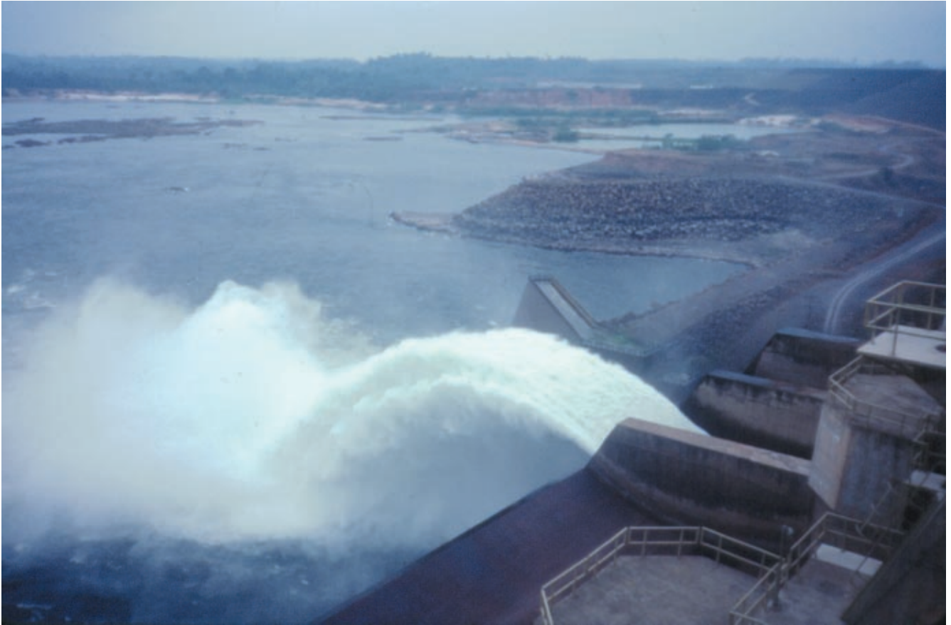
Figure 1. The Tucuruí Dam.

\text{m}^3/\text{sec} (range 6068–18,884 \text{m}^3/\text{sec} ), with a vertical drop of 60.8 m at the normal pool level of 72 m above mean sea level (msl) (Brazil, Eletronorte 1989, pp. 46, 51, 64). This contrasts with the situation at Balbina, where a small catchment and flat topography result in a reservoir of similar size as Tucuruí, but with a dam that generates much less power. While the Balbina experience also contains many lessons for Brazil's future hydroelectric development (Fearnside 1989a), Eletronorte officials often (unwisely) dismiss these as irrelevant on the grounds that Balbina is so fraught with obvious faults that it is an aberration that will never be repeated due to subsequent improvements in considering the environment in decision-making. 1 Tucuruí, unlike Balbina, has always been whole-heartedly defended by Eletronorte as an example of successful hydroelectric development in the Amazon.