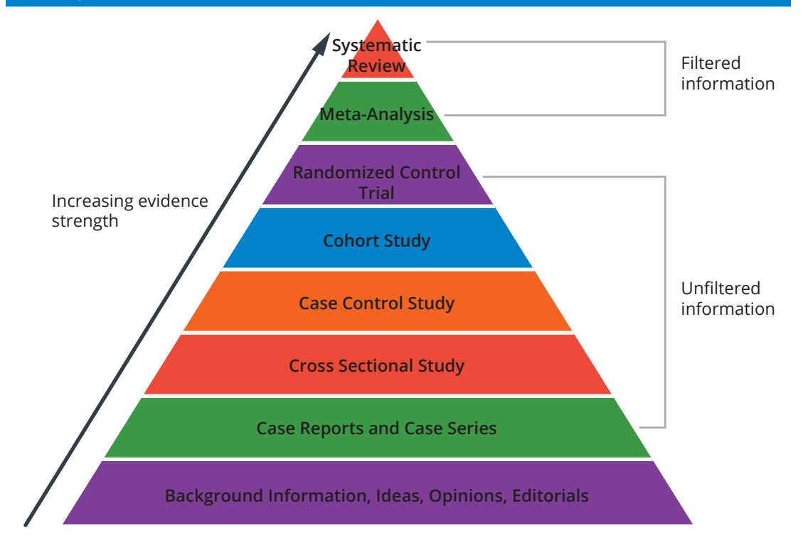
Figure 2. Evidence Pyramid used to assess and score literature. Adaptation of the Evidence Pyramid Diagram developed by the Medical Research Library of Brooklyn-SUNY Downstate Medical Center and the Cochrane Review.

Throughout the literature review process, each article was assessed and scored in order to provide documentation on the quality of the articles' contents. The Evidence Pyramid used in this literature review is adapted from the Medical Research Library of Brooklyn-SUNY Downstate Medical Center and the Cochrane Review (Figure 2). The pyramid provides both a conceptual and visual representation of the quality and amount of evidence available. Systematic reviews hold the greatest academic rigor and are limited in number. In contrast, the bottom of the pyramid demonstrates a decrease in the quality of evidence, yet is more widely available. The levels of the pyramid can be distinguished by two groups: filtered information and unfiltered information. Filtered resources appraise the quality of studies and often make recommendations for practice. Unfiltered resources are comprised of primary resources, which must be checked and verified to ensure that the information is valid and reliable.