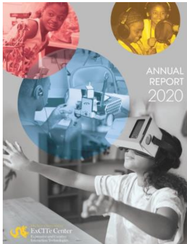
1 - Annual Report 2020 7

(For past reports follow this link: https://bit.ly/exciteannualreport )