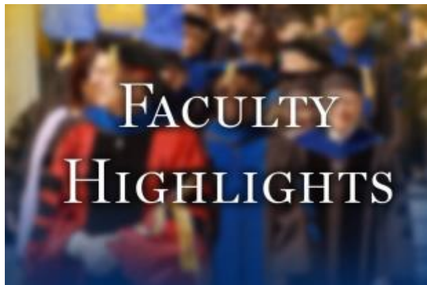
1 - Recent Grants and Awards 9

For the full list of recipients, visit this link 8 !