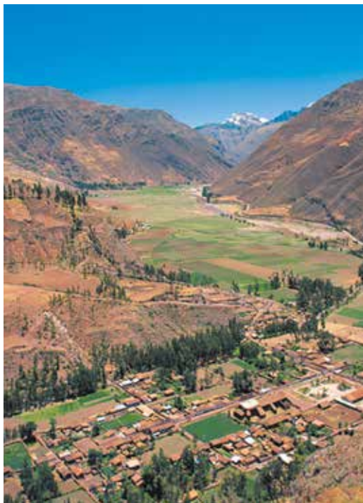
The beautiful and historic Sacred Valley