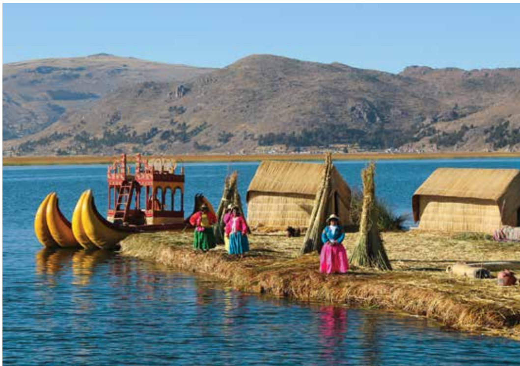
Local women on Uros Island

guided visit of the stunning “Lost City of the Incas.” Thanks to its small size, our group will move nimbly through the ruins and have the leisure to absorb the beauty and mystery of this haunting UNESCO World Heritage site. Mid-afternoon we return to Aguas Calientes and our hotel, with time at leisure before dinner together tonight. B,L,D