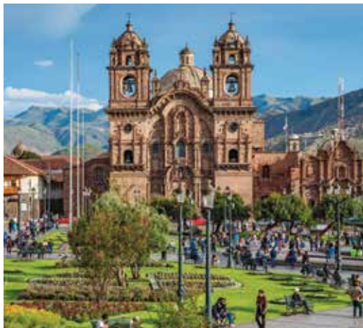
Cuzco, UNESCO site and former Inca capital

Day 11: Arrive U.S. We arrive in the U.S. today and connect with our return flight home.