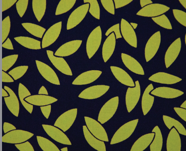
L & E Stern Textile sample Fall 1935, USA Anonymous donor