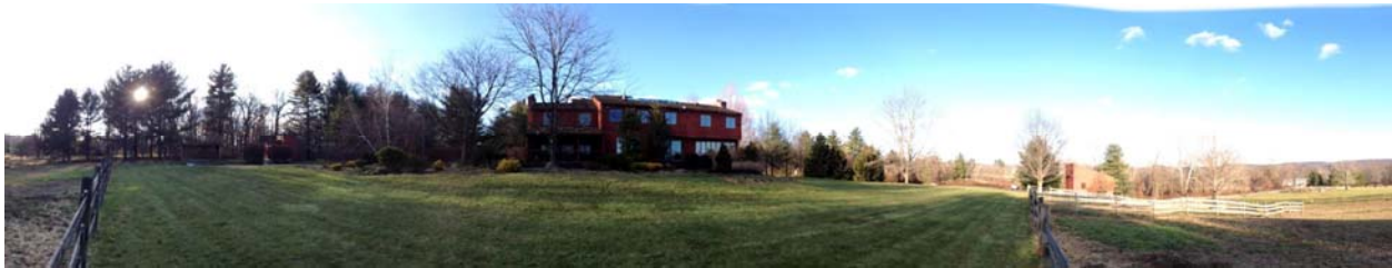
Semi-panoramic view of site looking north and west – back of existing structure and horse corrals to the rear

See electronic file for additional photographs