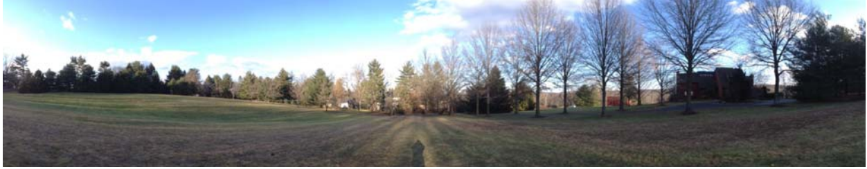
Semi-panoramic view of site looking north and east – meadow along road and access road – existing structure to the right