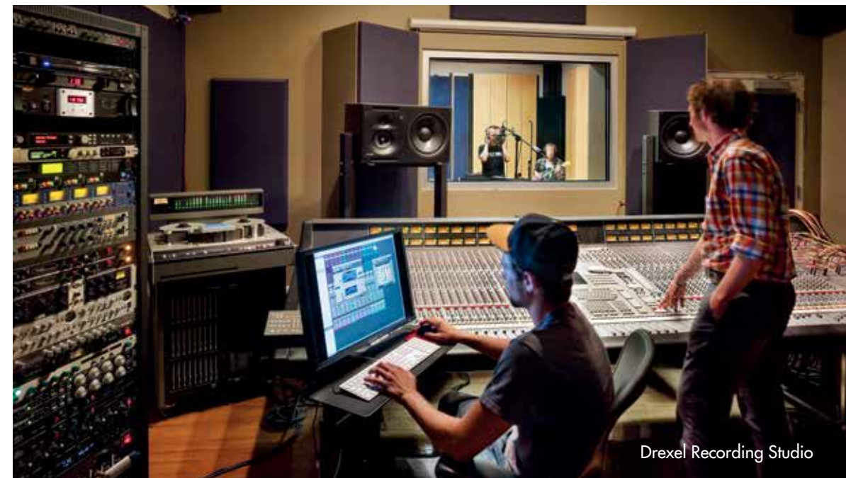
Drexel Recording Studio

By the time you graduate and enter the workforce, you will have built a résumé of real-world experience that will set you apart from your peers. Learn more about our media programs at drexel.edu/academics .