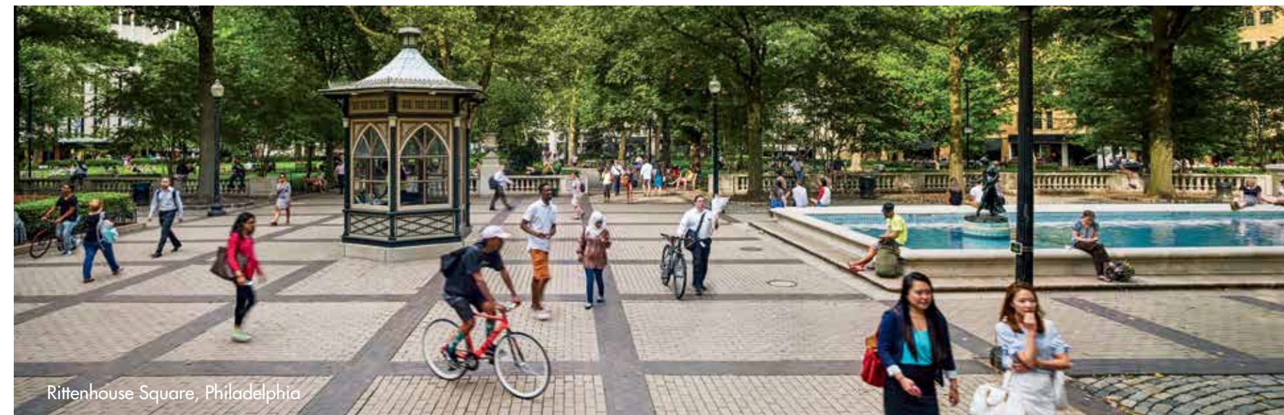
Rittenhouse Square, Philadelphia

Public transportation is just steps away from campus — it's easy to enjoy an authentic cheesesteak and then visit the famous Philadelphia Museum of Art. You will find that all areas of the city are interconnected by simple means of travel, and getting to historic sites around the city or connecting to various locations across the country is an easy task. Living in Philadelphia provides access to everything from farmers' markets in Lancaster County to ski and snowboarding locations in the Pocono Mountains to the best beaches in the Mid-Atlantic.