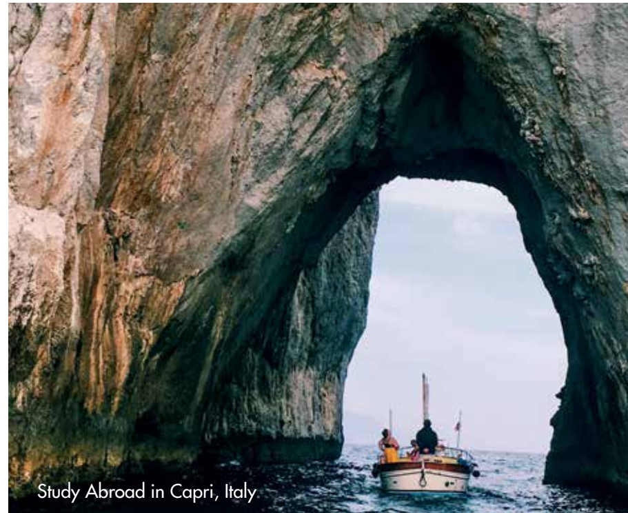
Study Abroad in Capri, Italy

Civic Engagement: We believe in the importance of giving back to local communities — there are always opportunities to make an impact and serve the community here. Students can get involved on campus through Drexel's Lindy Center for Civic Engagement and the Dornsife Center for Neighborhood Partnerships during community-based learning courses and volunteering for community service. But our impact doesn't stop there; our dedication reaches out globally to improve the world around us.