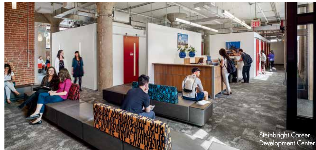
Steinbright Career Development Center