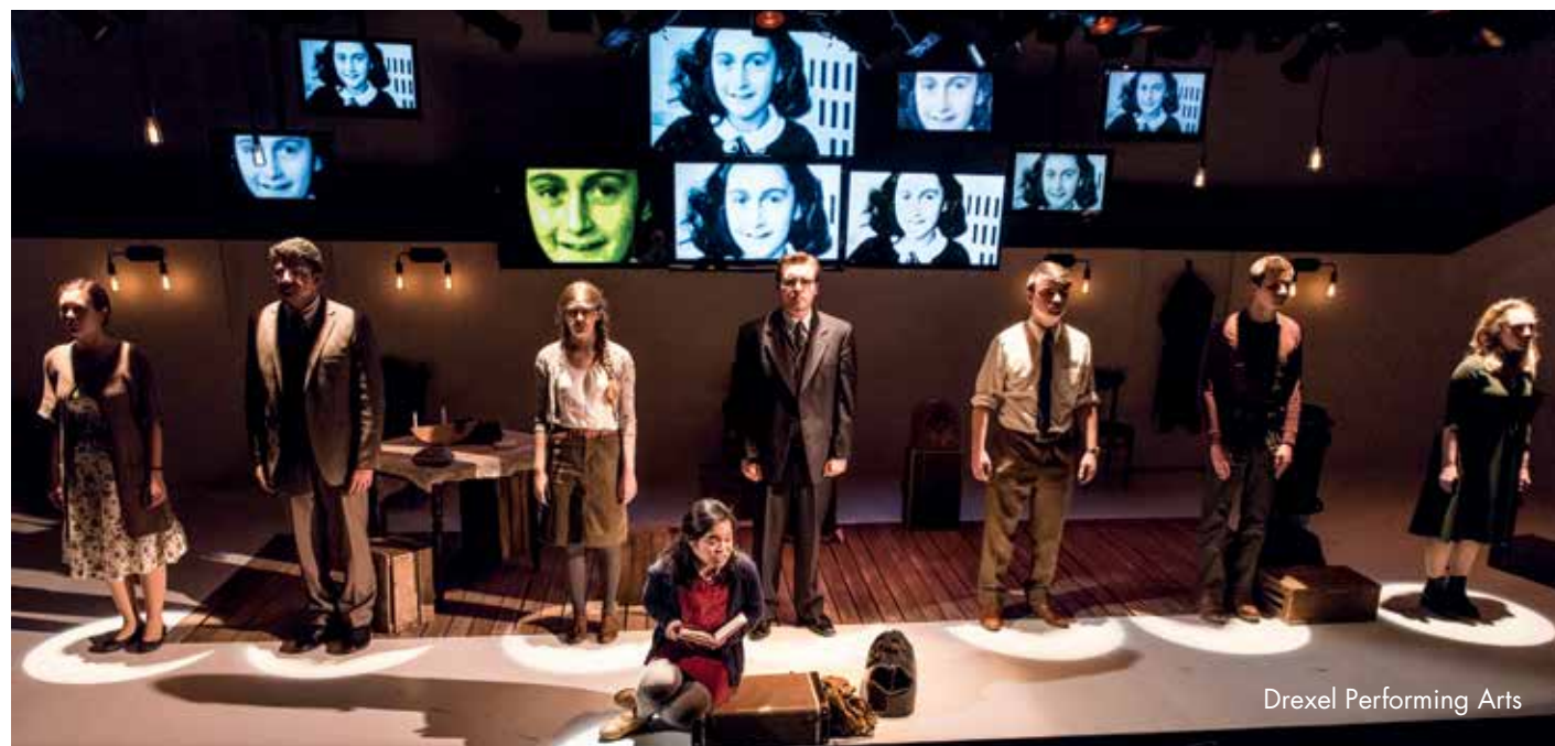
Drexel Performing Arts

In a chaotic world, it is those who breathe life into our surroundings that keep cultures alive and flourishing. If this sounds like you, Drexel will help you hone your talents and bring your ideas to fruition. Learn more about our arts programs at drexel.edu/academics .