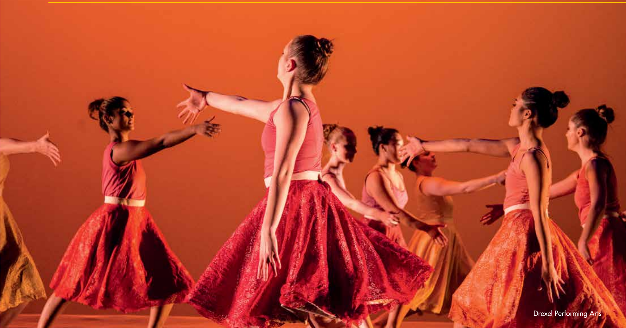
Drexel Performing Arts

Capturing emotion, power, and beauty, art is the most ancient and universal form of expression. It's part of human nature to creatively channel our imagination, and those who do it best make the world a profound and rewarding place to live in.