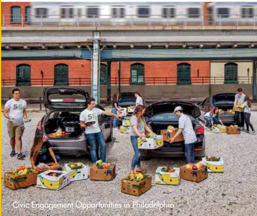
Civic Engagement Opportunities in Philadelphia