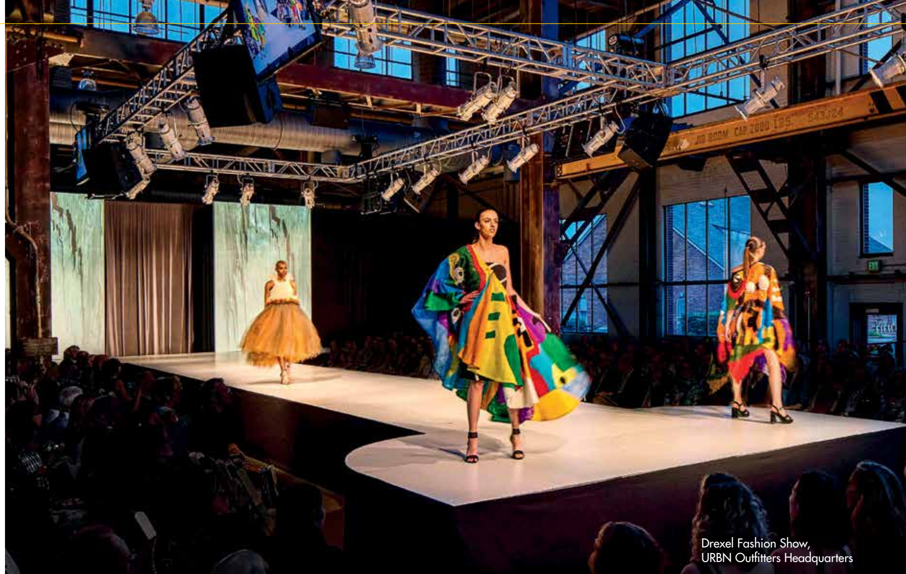
Drexel Fashion Show, URBN Outfitters Headquarters

The aesthetic appeal of the structures and items that surround us are all thanks to the design of artists around the world. Whether it be fashion, architecture, or even web design, there is a creative mind behind the process. Designers work to build appeal as a means to an end. The goal could be to captivate an audience that sits by a runway or invoke emotion to drive a social movement. No matter what your objective is, with a Drexel education, you can use your passion for design to make a difference.