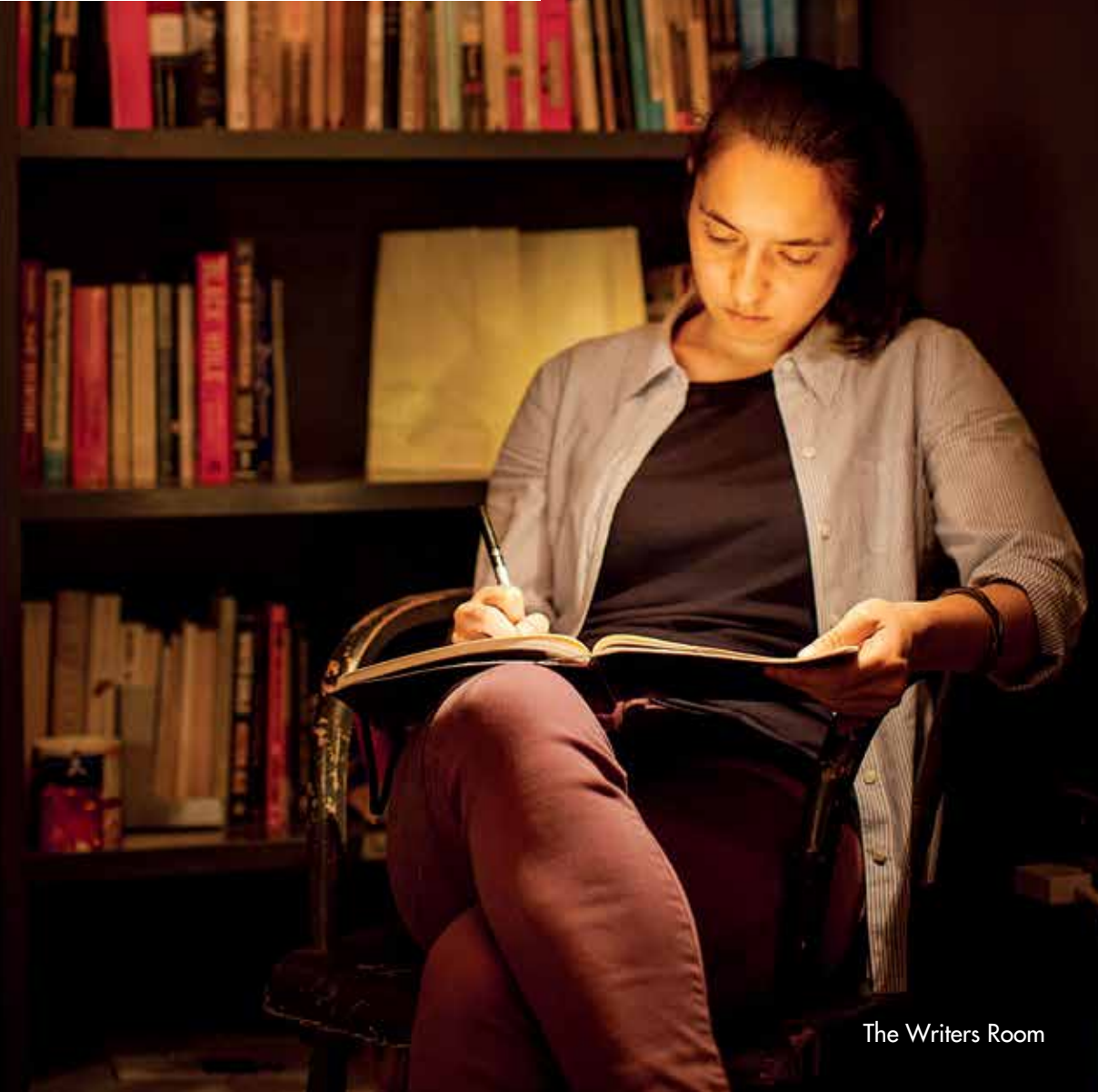
The Writers Room