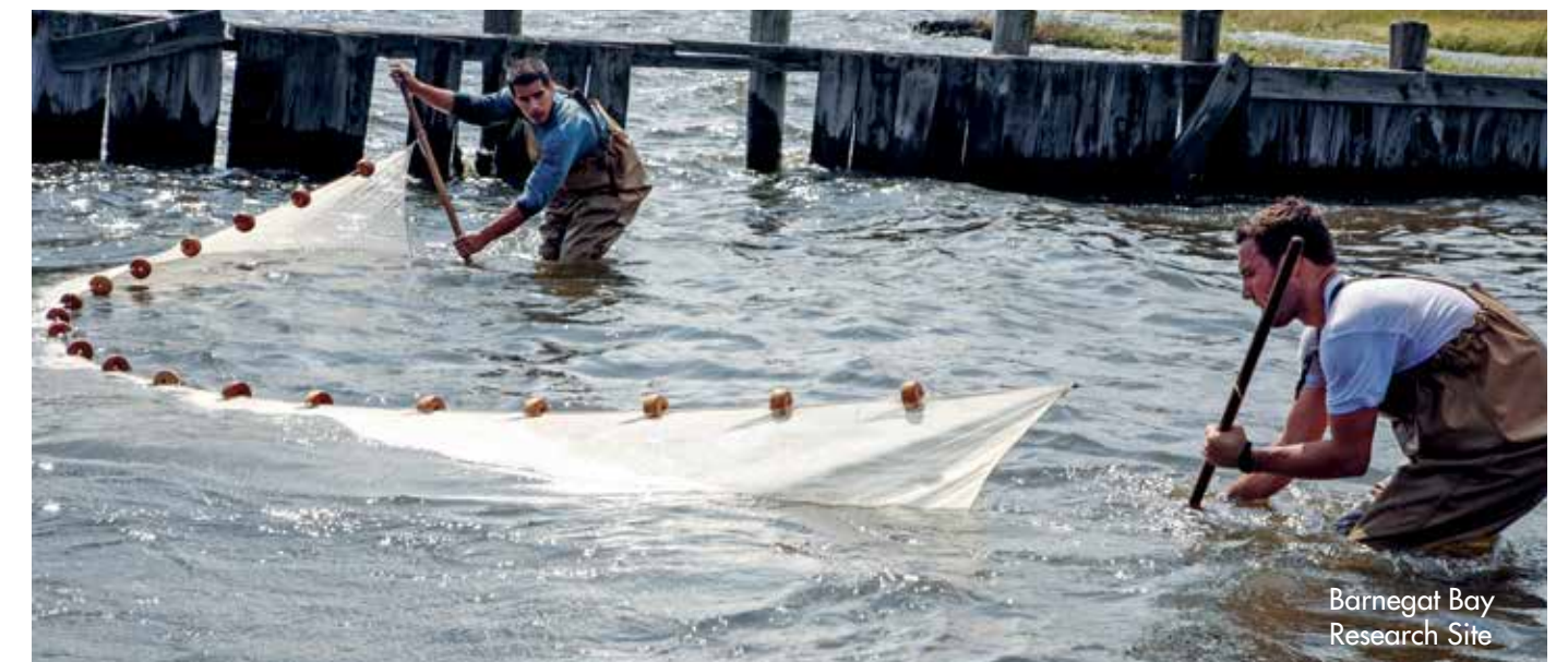
Barnegat Bay Research Site