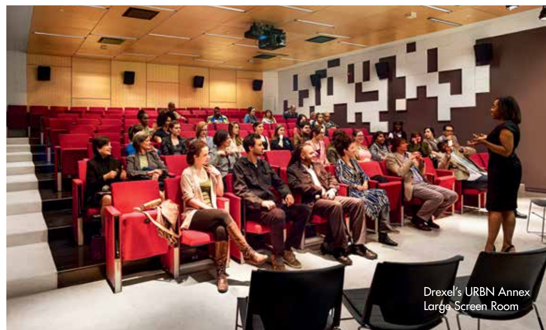
Drexel's URBN Annex Large Screen Room

By the time you receive your degree, you'll have made your mark through experiences you won't find at any other university. Through Drexel's design programs, you can utilize your talents to shape the world around you. Learn more about our design programs at drexel.edu/academics .