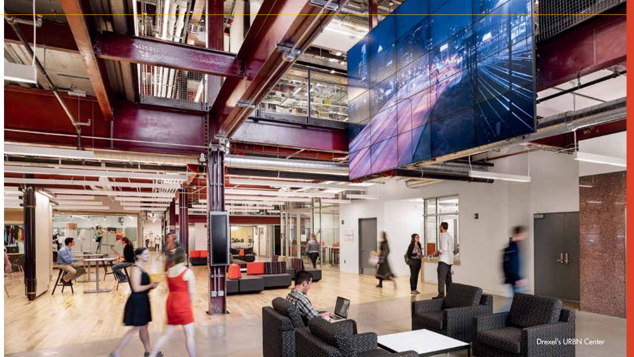
Drexel's URBN Center

The basis of influential art is storytelling. The medium used to tell a story, however, has constantly evolved throughout time. These variations include song, television, theater, augmented reality, and more. If you swell with pride the moment that your story strikes a chord with an audience, then Drexel can help you to develop as a dynamic composer, communicator, and producer of entertainment.