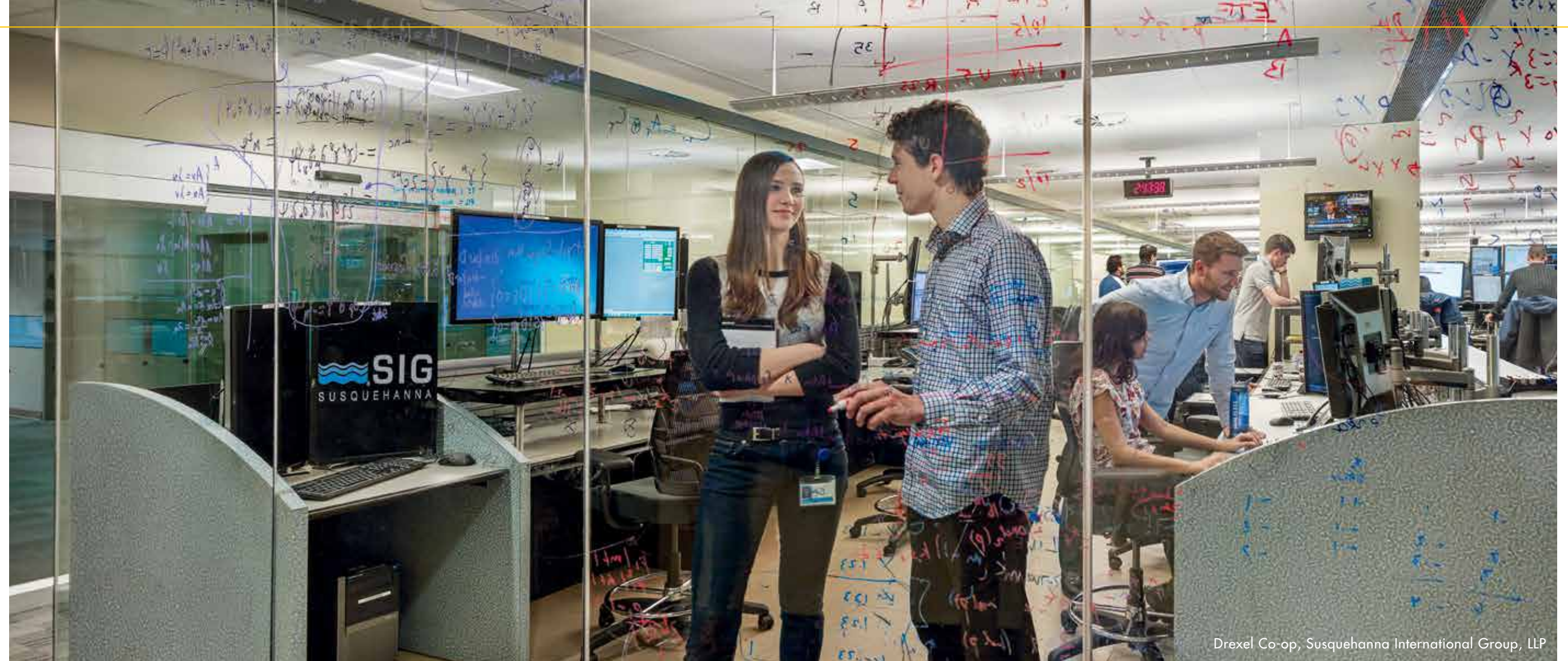
Drexel Co-op, Susquehanna International Group, LLP

The Steinbright Career Development Center, one of the largest collegiate co-op and career services teams in the world, sets you up for success at Drexel from day one. Whether you're looking for potential co-op employers, research opportunities, or post-graduate endeavors, Steinbright connects you to Drexel's constantly growing network of employers and industry leaders while also building your résumé and interview skills through workshops and information sessions. Our unique combination of world-class career services and dedicated counseling professionals will help guide you to discover your interests and develop your professional tools.