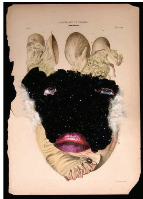
The Histology of the Different Tumors of the Uterus 2001, Collage on Medical Illustration paper, 18 x 12"