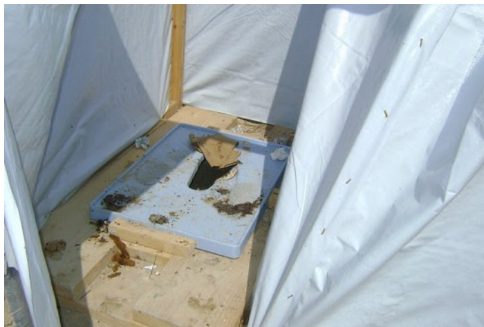
A public latrine, with indentations for feet on either side of the hole.

In the course of the 42 days that the camp had been in existence, those surveyed overwhelmingly reported that relief in the form of food aid had been provided only one time, in the form of dry rice and beans for cooking. Seventy percent stated that they had never received food aid. Further investigation revealed that when the food aid did come, it was preceded by the distribution of “tickets” on the day before, which had to be shown in order to receive a food package. There were far fewer tickets than families in Acra and, according to some, the single resident chosen to distribute the tickets first allotted them to friends and family. Half of respondents were forced to spend meager resources buying food and an additional 25% received handouts from friends, relatives, or neighbors.