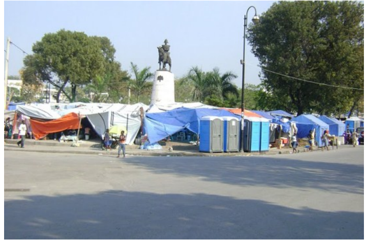
Shelters filling a public square. Portable toilets provided by aid organizations sit on the curb.

Plastic portable bathrooms are placed in sets of twelve along the sidewalk or along the roadside at the perimeter of the different camp zones. The investigators observed several of the bathrooms being emptied by trucks with large vacuum hoses in the hours of the investigation. CAMEP, the Haitian government's water authority, appeared to be in charge of the trucks. A quick and random inspection of conditions showed that they are dirty and disgusting to use, as there are far too few of these devices for the tens of thousands of people who need them. Toilet paper was lacking in most, although the investigators did see some distribution of