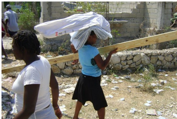
Each family received materials for building a shelter, including two tarps, a 12' beam, saw and shovel.

The families and their temporary shelters were evenly distributed along the slopes of both North and South Acra. Unlike the downtown camps, the shelters were relatively spread out. At the top of North Acra, families were living in approximately 80 large ten-person tents given to them by the Islamic Relief Agency. This tight cluster of neatly ordered khaki colored tents contrasted sharply