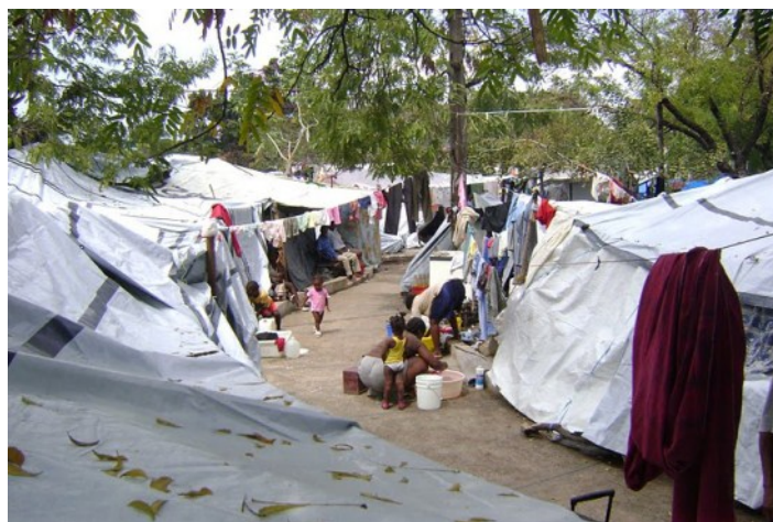
Pétionville camp. Rows of tents line a walking path running through a public square.

BAI surveyed 535 households in Pétionville. Household size ranged from 1 to 21 and the number of children ranged from 0 to 13. The average household had 5 people and fewer than 2 children. There were no reports of injured, killed or missing people. 61% of houses were destroyed and 26% were damaged. All households urgently need urgent assistance: water (63%), food (93%), medicine (68%), clothing (65%), and tents (98%).