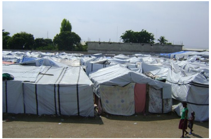
A view of a small section of La Couronne camp.

There are 8,200 total individuals living there, or 262 families. 14 The most striking feature of this camp was the number of children. They seemed to be everywhere, fetching water, running, bathing younger siblings, and playing with distributed food. One 11-year-old boy had found some type of ready-to-eat meal in bag that could be manipulated in such a way that it heated and cooked the contents. Curious friends gathered around to watch it work. When the boy opened it, steam shot out, and then he reached in to eat what looked like beef stew on rice. When he had his fill, he passed the bag around. Although it was as much nourishment as it was curiosity, one is reminded that such meals in individual bags are not how Haitian's eat. Similarly, another boy had a single-serving tube of some high protein peanut butter-like substance in a squirt packet made for emergency nutrition. But he was observed gathering his friends who had been playing in the dirt and had them put their hands out for him. He squeezed a portion into everyone's palm. In such a fashion, not only did the first beneficiary not get the full nutrient benefit, but it made for