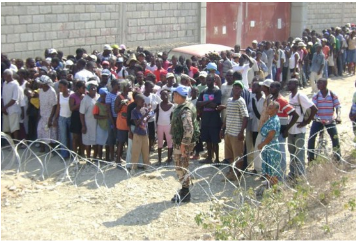
Concertina wire acts as a cordon between those waiting for food and the rest of the camp.

After hearing repeated stories of deprivation, neglect and mistreatment, much like the event witnessed in Marassa #11, two surveys were conducted to identify earthquake losses and to investigate aid distribution for displaced persons.