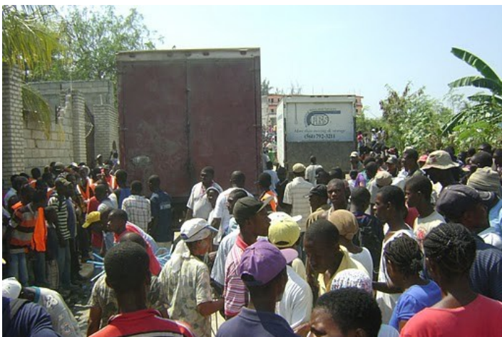
Camp residents arrive too late for the distribution of building materials.

Only 35% of families surveyed reported being provided with drinking water. Sixty percent of water relief was provided by the French Red Cross, but it was described by residents as "lou" or heavy water that stuck in their chest all day. The water was said to "goute lame a" or "taste like the sea." Many used this water only for bathing (filling a