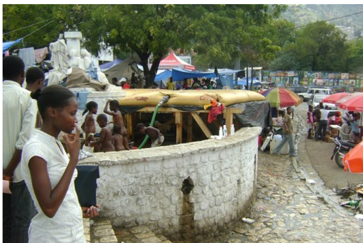
Children clean themselves in a makeshift bathing station utilizing a water storage bladder provided by CARE.