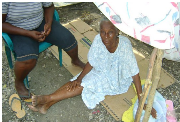
Only cardboard keeps this elderly woman from spending her day in the dirt.

Upon entering the camp, the investigators saw and visited a large tarp structure that had been built earlier that day by an American evangelical group of doctors and nurses who had set up a medical clinic and stated that they planned to be there for two weeks. The “field hospital” was led by an American man, with no Creole language skills, who walked along the line of patients with a wooden baton, adding an unnecessary feeling that the group had come to provide aid to savage beasts, not needy people.