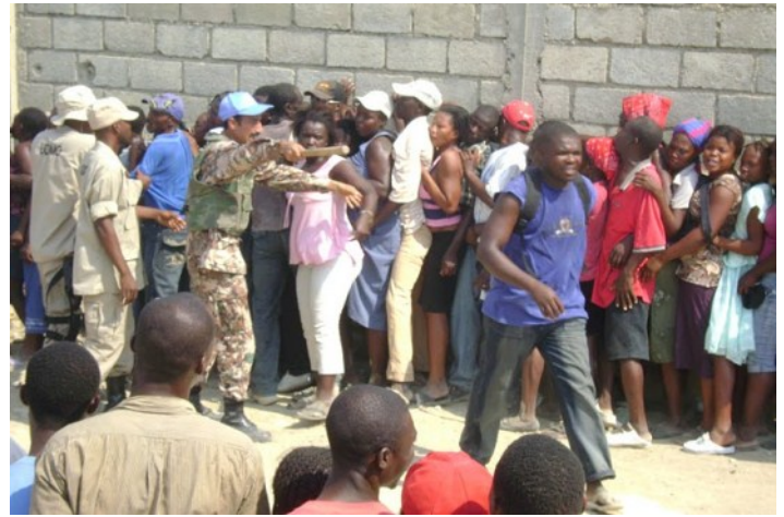
A baton-wielding U.N. soldier removes an individual from the queue.