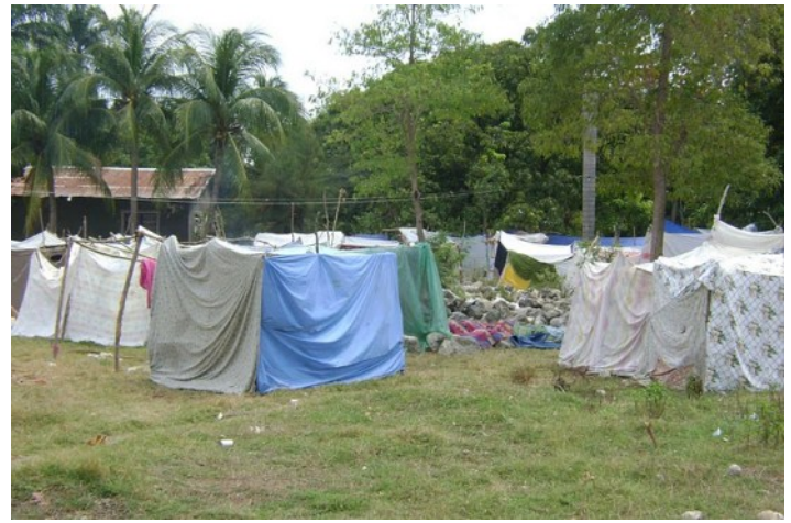
Bouzi camp. The shelters are constructed without any materials from aid organizations.

The investigative team surveyed one camp in a cluster of camps in Croix-des-Bouquets, a large town just east of Port-au-Prince. The team entered the town, observing various camps and asking people to identify other camp locations off of the main streets. As a result, the team stopped to survey one large camp at Parc Rony Colin and then a cluster of smaller camps off the main road. This cluster is called Bouzi, named after the area's largest landowner. The Parc Rony Colin camp covered a grassy area about the size of two soccer fields, and was surrounded by bustling activity in the streets and people selling food items, water, and soft drinks.