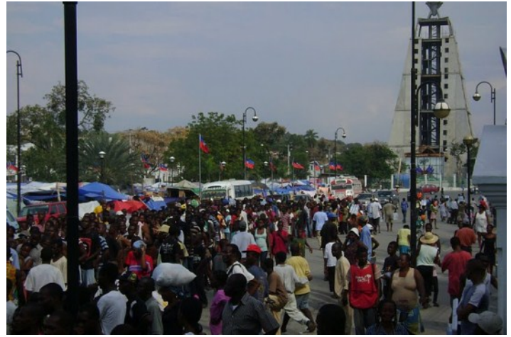
Residents gather near the Bicentennial Tower on the Champs de Mar for water.

“Champ de Mar” is the name given to the popular, central downtown area of Port-au-Prince that is a mixture of pedestrian parks, street vendor plazas, and wide boulevards. The clustered area includes national and iconic landmarks such as the presidential palace, the national museum, the bicentennial tower, and government buildings. The displaced persons camps have been established in every part of the massive area that was otherwise flat and open. Champ de Mar was a point of interest and source of Haitian national pride. Now Champ de Mar is baking under a continuous patch-