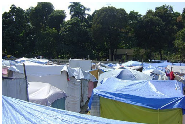
Makeshift tents erected on ADUH's campus grounds.

BAI surveyed 828 households in Carrefour. Household size ranged from 1 to 21 people and the number of children ranged from 0 to 8 children. The average household had 5 to 6 people and half of all households had at least 2 children. The number of injured people per household ranged from 0 to 7 and on average, 1 out of every 10 households reported an injured person. The number of deaths per household ranged from 0 to 3 but most households did not report a death or missing person. Forty-nine percent of houses were destroyed, 48% were damaged, and 3% were unharmed. Eighty percent of households urgently needed some form of assistance: water (61%), food (79%), medicine (57%), clothing (63%), and tents (78%)