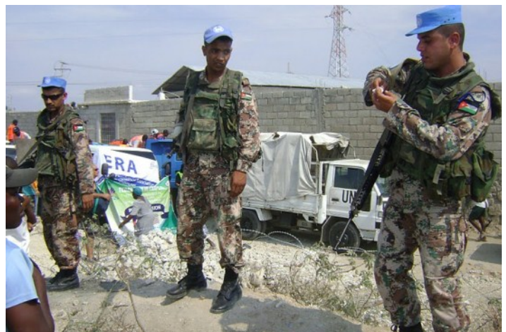
The U.N.'s heavily-armed Jordanian contingent monitors the camp prior to food distribution.