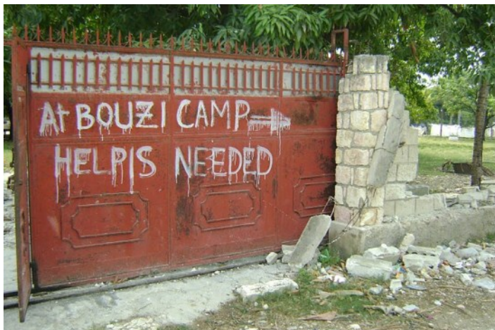
A painted sign meant to direct assistance to the Bouzi camp's location.

Nearly half lived in the open air. The rest lived crowded under shelters fashioned from twigs, tarps, and bed sheets. Some (11%) had received pup-tents from the U.S. Army. Some shelters were made with only one sheet, barely forming a partial "roof" or wall, and most looked like they served only to provide a few square meters of shade. Further investigation, however, revealed that these bed sheet and twig shelters were all that the people had. They were in a field of dried weeds which constituted their shelter floor. Some mothers had actually gathered cinderblocks from fallen buildings and shaped them into a cement "mattress" for the children to sleep on. Nearly all respondents in-