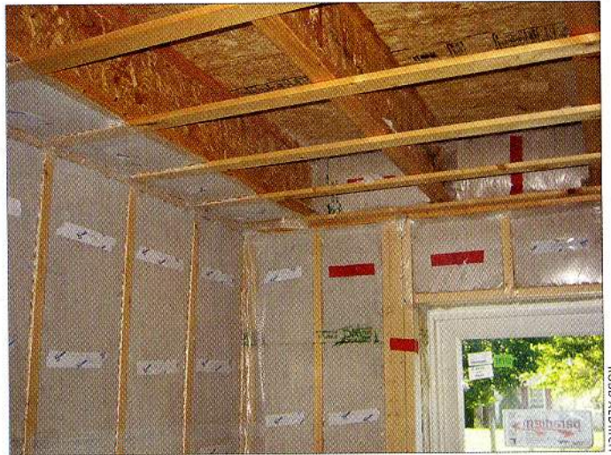
Double walls before (left) and after (right) the cellulose insulation was installed.

of 0.23. Ideally, RDI wanted to find windows with a higher SHGC—at least for the southern elevations. The search for an affordable window with higher solar heat gain—while keeping the low U-value—was not fruitful. Paradigm Windows did, however, offer to provide double-pane windows with the low-e coating on surface 3 (on the inside window in order to block heat loss). This raised the SHGC to 0.37 and provided a U-value of 0.26. The final specifications for windows at the Village are shown in Table 1.